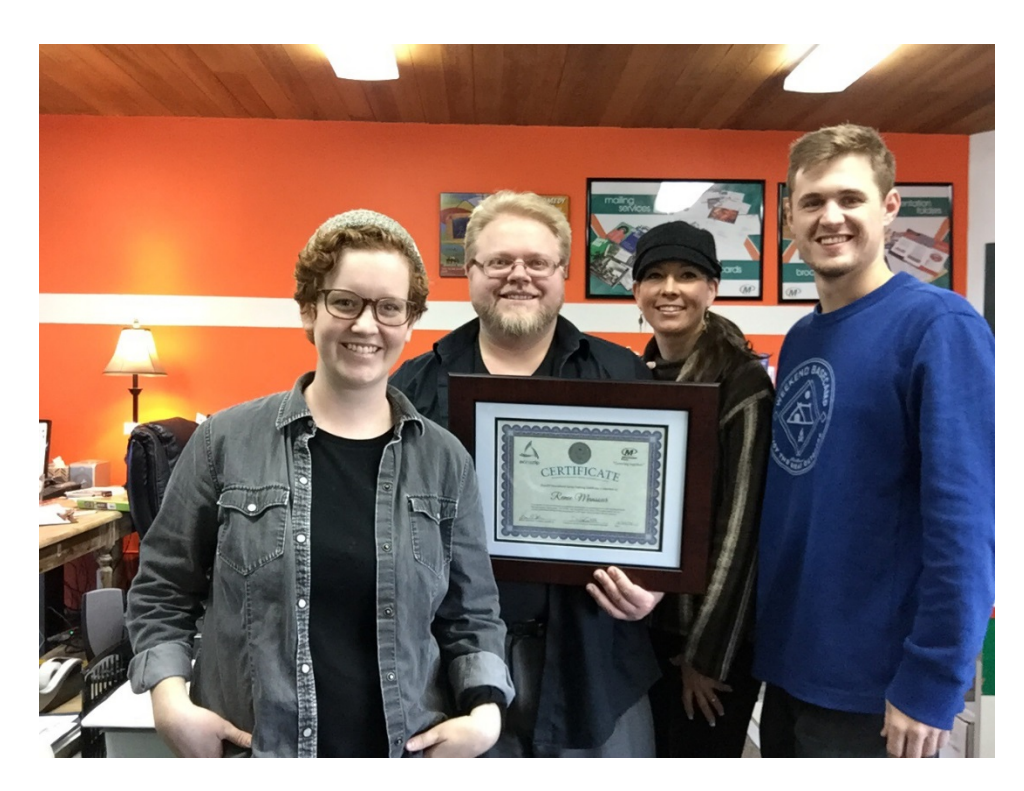
Minuteman Press AccuZIP Franchise Development Graduates MMP – Bend, Oregon